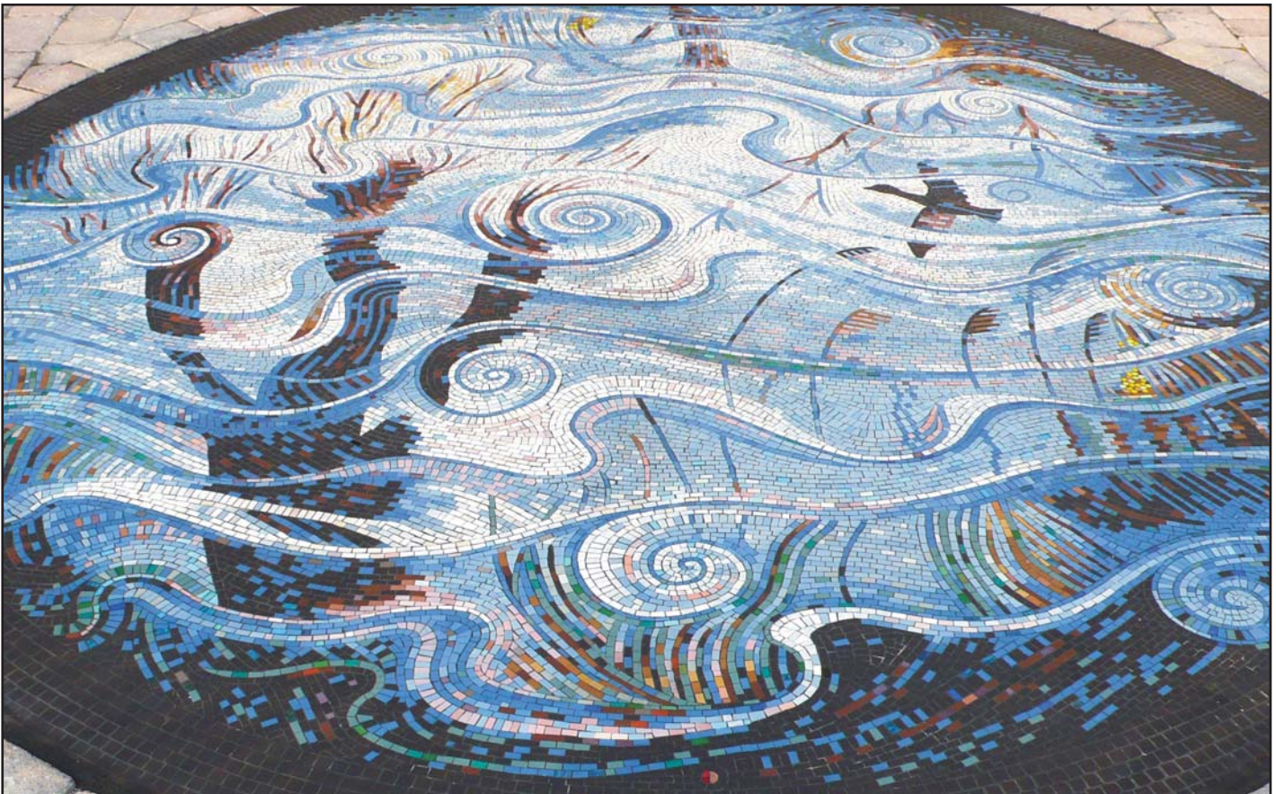
The main central mosaic includes the distinctive pol-larded trees and rushes.