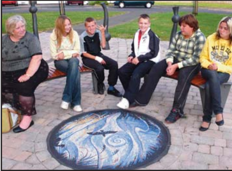
Local residents gather at the Moorhen mosaic.

W ESTON-SUPER-MARE was the setting for this triptych of floor mosaics created by Gary using the local flora and fauna as its inspiration. The set of three exterior mosaics formed the focal feature for the refurbishment of a local shopping parade. The work began with consultation and design workshops with the local school, youth centre and two community centres.